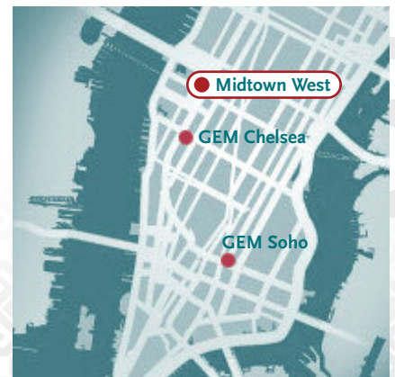
Visit any one of our three Manhattan locations